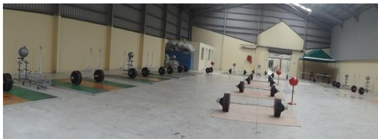
The large training hall in Wallis was well set up with 20 platforms, squat racks, sauna, etc.

of the weightlifters attending the institute have been funded continually by ONOC. This enormous financial assistance to the athletes via their NOC's by ONOC/ IOC Solidarity has taken the standard of weightlifting to the level that it is today. With 10 months to go to the Commonwealth Games, there is a very strong possibility that seven Institute lifters from the Pacific Islands could rank number one in their respective categories. And with some luck we could possibly have one or two more from other islands of the region ranking number one. The IWF also must be acknowledged for their continued support and financial contribution to the success of the Pacific Island lifters.