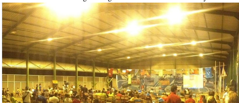
The weightlifting hall was continually packed during the 3 days of competition.