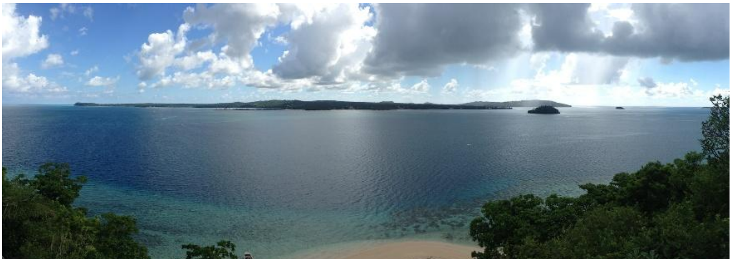
It was very difficult for our international technical officials on their day off to avoid this type of scenery. They found it very hard to keep away from this majestic part of the world.