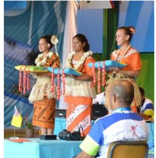
The medal presentation girls in their cultural attire added glamour to the victory ceremony.

The competition was fierce in some categories. Great battles were seen in the 62kg category, the 69kg category, the 77 kg category and in the 105+kg category. The large crowd attending the three day event really enjoyed the competition immensely. Amongst the crowd there were many Sports Ministers and National Olympic Committee leaders from the different islands of the Pacific.