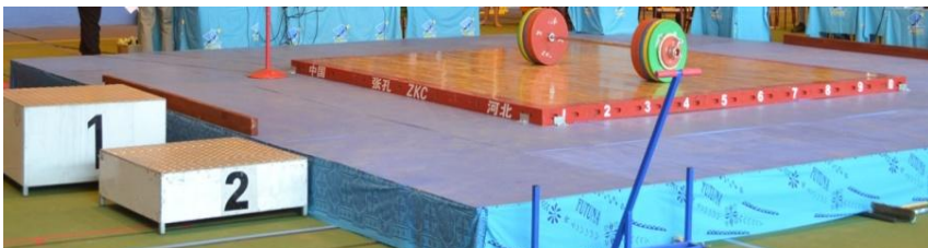
The stage took two days to complete with 12 volunteers working and the end product was magnificent. Having the coconut stumps was a brilliant idea and very economical.