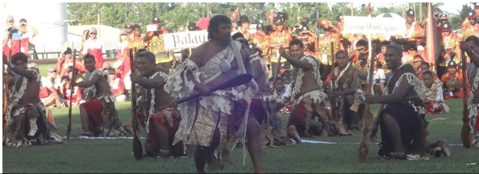
Wallis & Futuna showcasing their warriors at the Pacific Mini Games Opening Ceremony