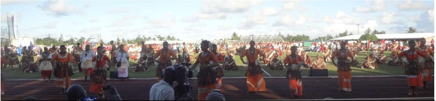
Polynesian dancing is beautiful and unique. Here we see the girls of Wallis & Futuna at their best.