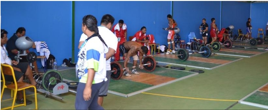
The warm up area was very well set up and had everything that major international event requires. It had nine platforms and fully equipped with ZKC equipment.