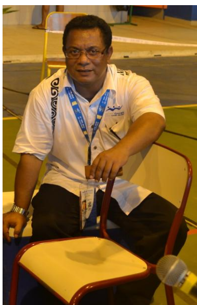
The President of the O.W.F. the Hon. Marcus Stephen from Nauru, relaxing during a break from jury duty. Marcus is also the Vice President of the Pacific Games Council.